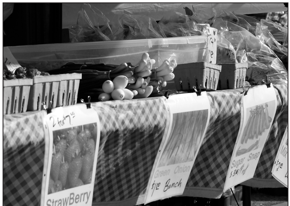
2010 Capitol View Farmers Market

The Capitol View Farmers Market will operate on Sharpsburg Drive (starting at the corner of North Star Drive) in the Grandview Commons on Wednesday afternoons from 3:00 - 7:00 PM from June 1st through October 12th. With the new Great Dane Pub located across the street, larger traffic is expected at the market this year.